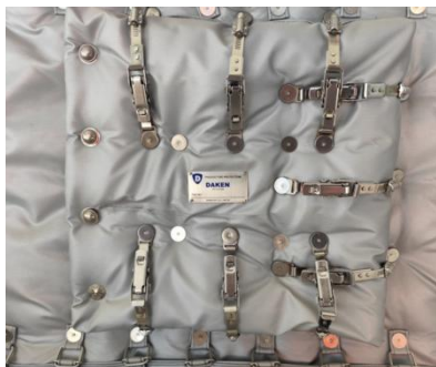
Quick Access Door