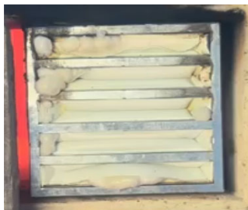
DFG (Unexposed Side) - 60 min into Fire Resistance Test