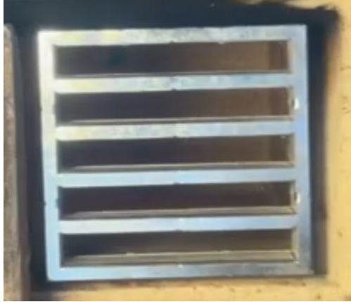
Before the fire resistance test (unexposed side)