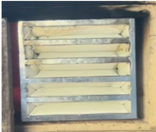
DFG (Unexposed Side) - 30 min into Fire Resistance Test